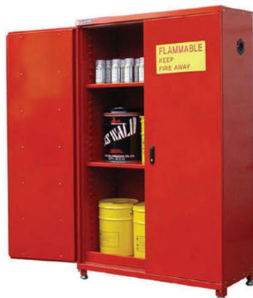
CFS-1100 / Red