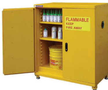
CFS-500 / Yellow