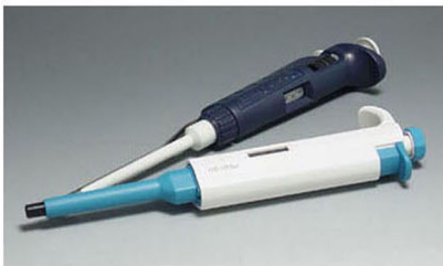
Auto Pipette / Kastec