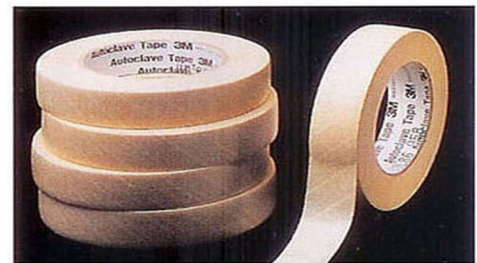
Steam Indicating Tape