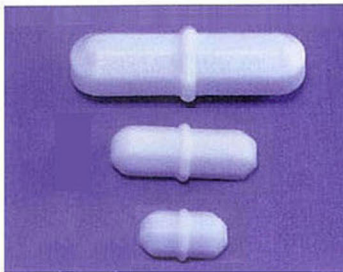
Spin Bar, Octagon