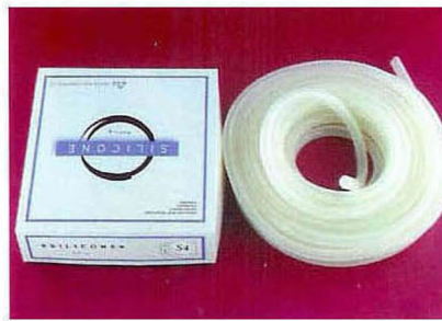
Vacuum Silicon Rubber Tube 10m/box