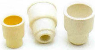
Rubber Septa 100pcs/pack