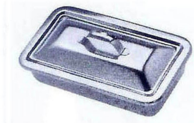
Instrument Tray with strap handle lid