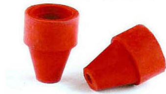
Glass Filler Adaptor 100ea/pack