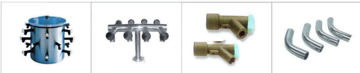
Drum Dry Chamber